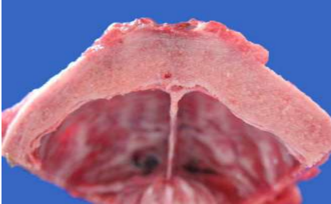
Figure 1: Thickened parietal skull bone from a Lion cub affected with Hypovitaminosis A